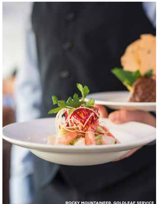
ROCKY MOUNTAINEER, GOLDLEAF SERVICE

Enjoy the luxury of train travel through the day, knowing that every night will be spent in the comfort of a hotel room.