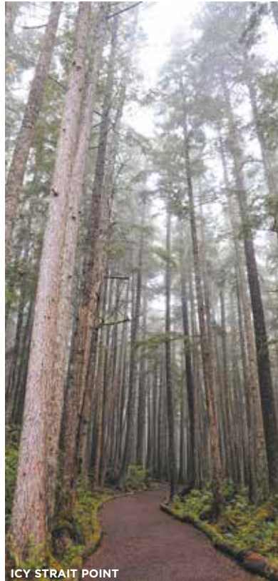
ICY STRAIT POINT

We always strive to enhance your incredible Regent Seven Seas Cruises® experience, as an example we are the only cruise line to offer you FREE UNLIMITED SHORE EXCURSIONS IN EVERY PORT OF CALL.