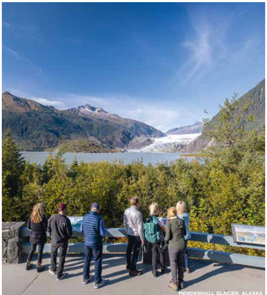
MENDENHALL GLACIER, ALASKA

On this voyage there's up to 46 FREE Unlimited shore excursions to choose from; you could ride the unique, amphibious Duck vehicle through the streets of Ketchikan before it glides into the harbour for a different perspective. In Juneau, set off on a 'Guide's Choice' adventure hike through the Mendenhall Glacier National Recreation Area , where you can spot numerous wildlife like black bears, beavers and porcupines.