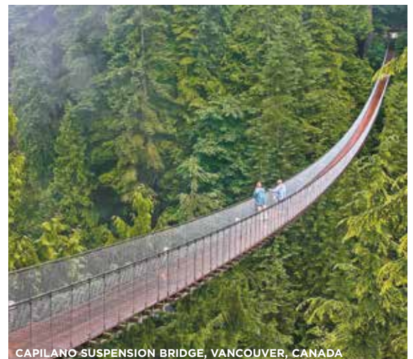
CAPILANO SUSPENSION BRIDGE, VANCOUVER, CANADA