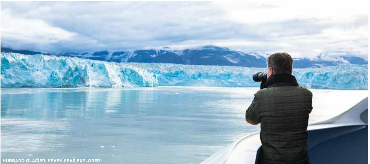
HUBBARD GLACIER, SEVEN SEAS EXPLORER®