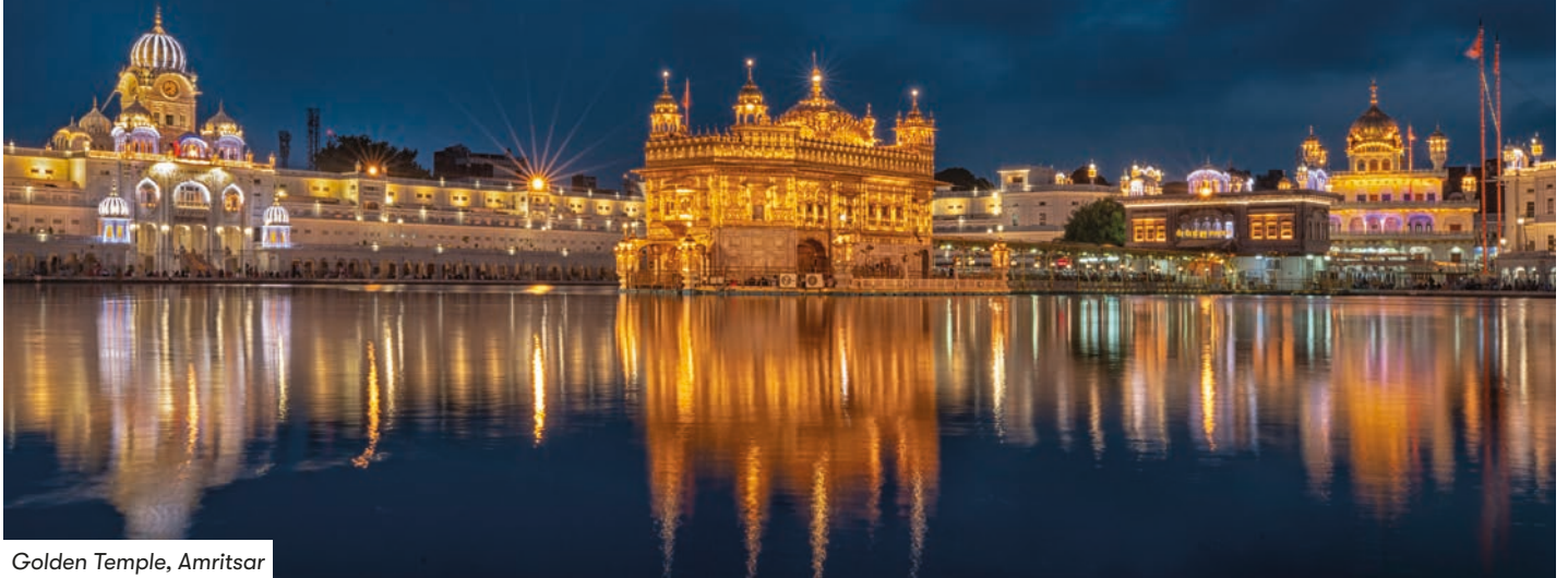
Golden Temple, Amritsar